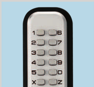
Push Button Lock