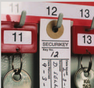
Sign Out Tab