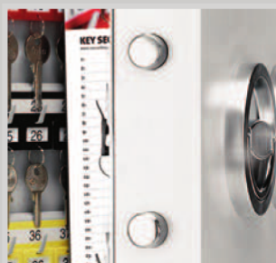
Door Slab and 20mm Locking Bolts