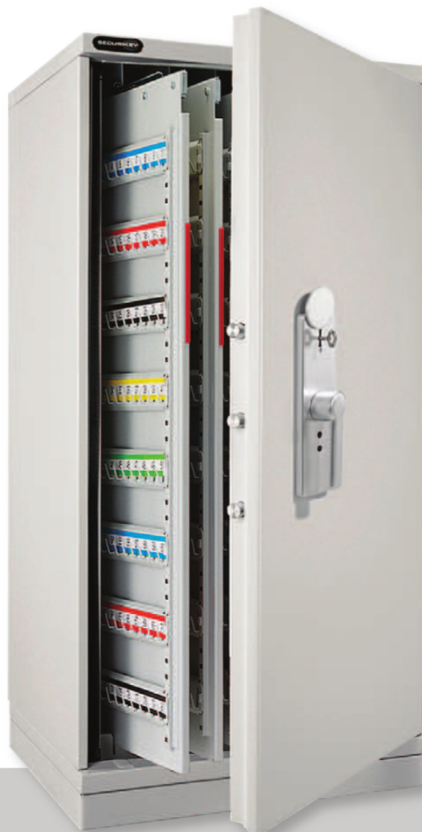
High Security 960