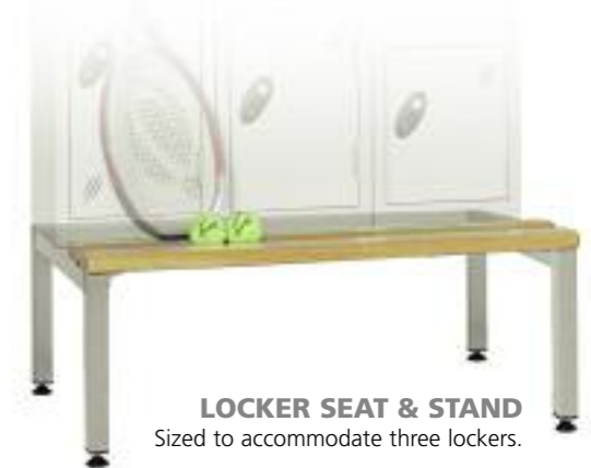
LOCKER SEAT & STAND Sized to accommodate three lockers.