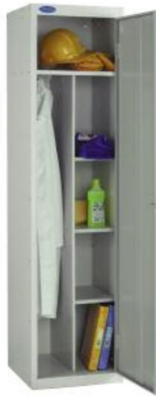
UNIFORMS LOCKER Complete with full width internal top shelf 305mm high, vertical centre partition, double coat hook and a further three half width shelves. WIDTH 460mm DEPTH 460mm TOP COMPARTMENT HEIGHT 305mm