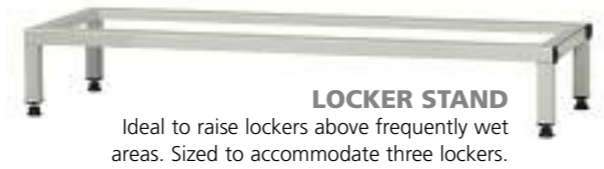
LOCKER STAND Ideal to raise lockers above frequently wet areas. Sized to accommodate three lockers.