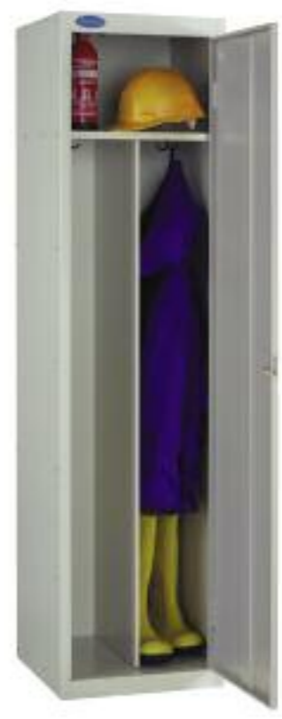
CLEAN & DIRTY LOCKER Complete with full width internal top shelf 305mm high, vertical centre partition and two double coat hooks. WIDTH 460mm DEPTH 460mm TOP COMPARTMENT HEIGHT 305mm