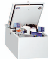
Optional Data Protection Insert FSDPI09