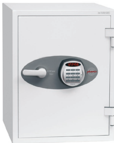
Titan II FS1273E