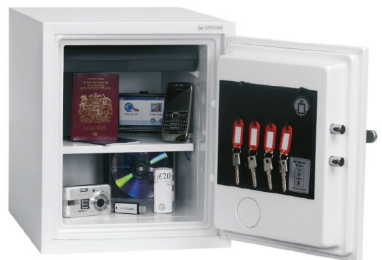
Titan II FS1272K/E