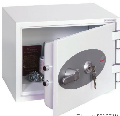
Titan II FS1271K