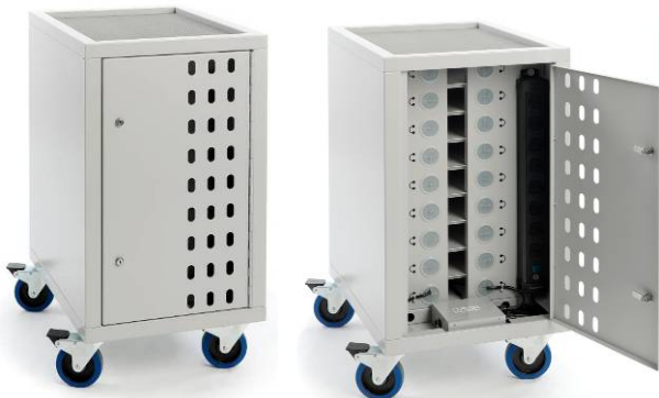
mini 16 front & charging compartment

Uses the original laptop chargers so no expensive call out charges or on-going maintenance costs when swapping laptops.