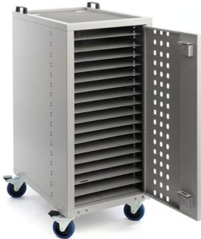
mini 32 Laptop Trolley