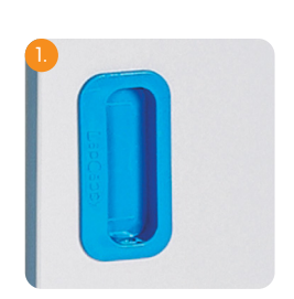
Inset door handles prevent protruding parts eliminating breakages.