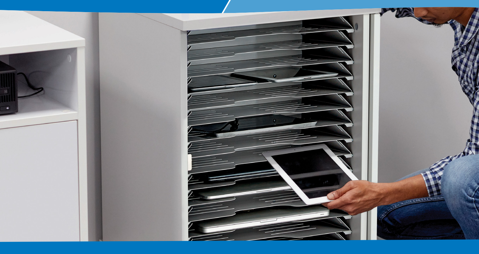
20-Device AC Charging Cabinet for Laptops, Tablets & Chromebooks up to 15.6" - Horizontal