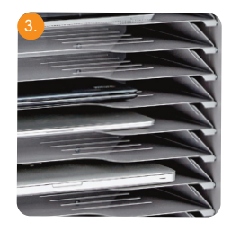
Devices sit horizontally within roomy compartments to protect the device with space for protective cases.