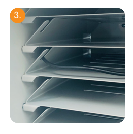
Cable clip channels located in the side of each device storage shelf to ensure cable is locked into position.