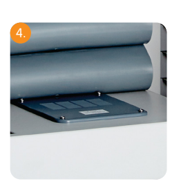
Soft-start power management system incorporates in-rush surge protection, sequential start-up and residual current protection. Simultaneous charging of all 16 devices to ensure devices are fully charged as fast as possible.