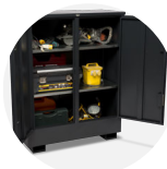
TuffStor Cabinet TSC3