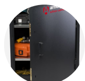
TuffStor Cabinet TSC2