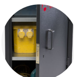
TuffStor Cabinet TSC1