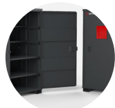
TuffStor Cabinet TSC6