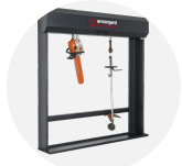
StrimmerSafe Rack SSR