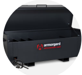
StrimmerSafe Vault SSV6