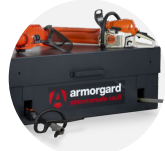
StrimmerSafe Vault SSV12