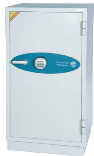
Fire Commander FS1901E

Optional Extras Available Height adjustable shelves Suspended filing cradles Fingerprint lock Data Protection Insert (FS1902E & FS1903E only)