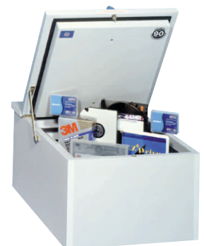
Data protection Insert FSDPI08

Optional Extras Available Key lock on each drawer REDL2 Electronic Lock & Key Lock Fingerprint lock Data Protection Insert Safe Alarm