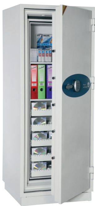
Data Commander DS4622E