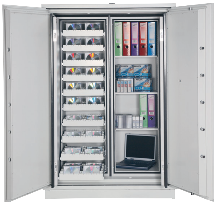
Data Commander DS4623E