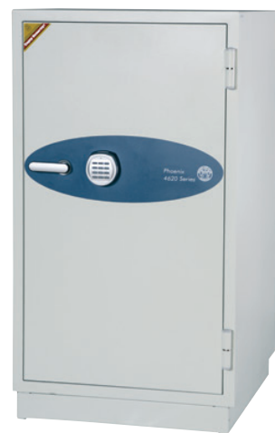
Data Commander DS4621E